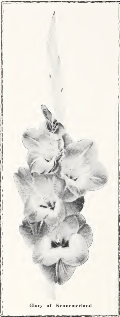
Glory of Kennemerland